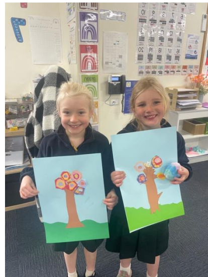
Kandinsky inspired Circle Trees – excellent examples of abstract art.