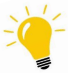
Let Your Light Shine is our Diocesan theme. We share our light in so many ways!!